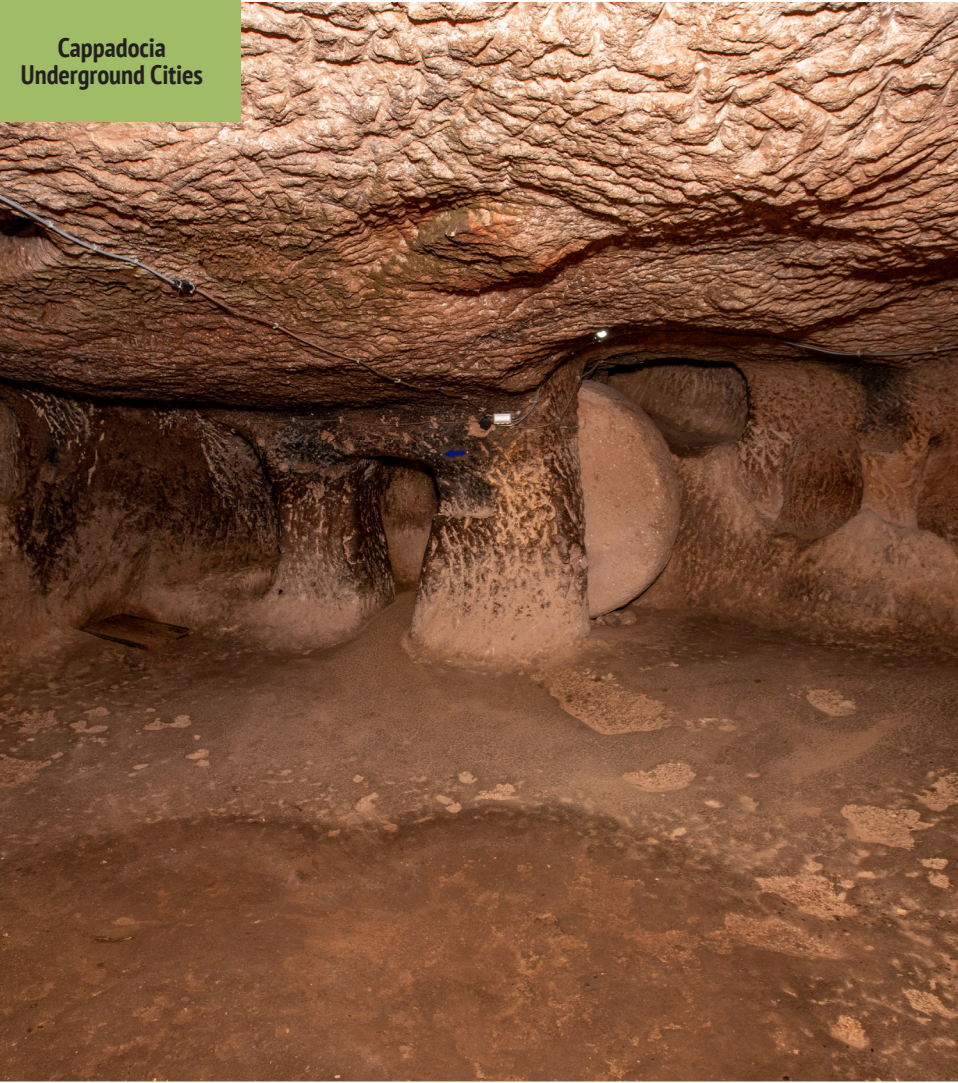
Cappadocia Underground Cities

There are about 150-200 of underground settlements of various sizes, which are one of the most interesting cultural riches of the Cappadocia Region. This number may increase even more since there are large and small rock settlements in all the towns and villages in the Cappadocia Region. Most of these rock settlements were built by carving down soft tuff downwards deeply. The reason for the construction of underground cities is for people to secure themselves. Hundreds of rooms in underground cities are connected to each other through long galleries and tunnels like labyrinths. The reason why galleries are low, narrow and long is to limit the movement of the enemy.