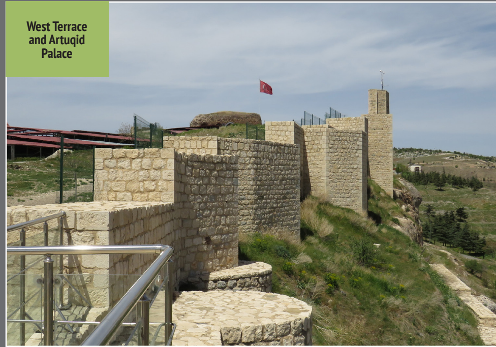
West Terrace and Artuqid Palace