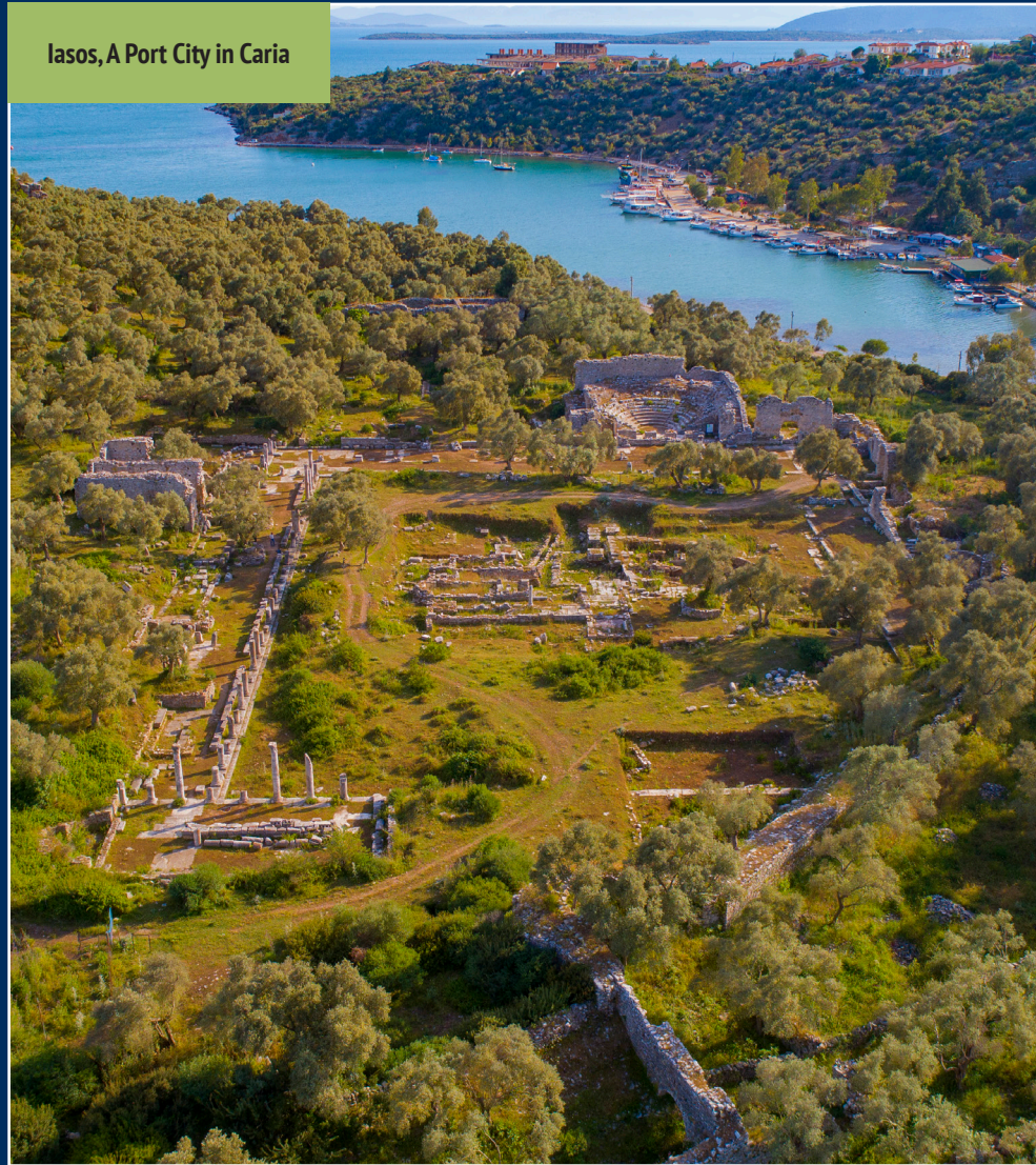
Iasos, A Port City in Caria

Although the signs of life in the city belong to antiquity, the visible structures are from the Hellenistic, Roman, Eastern Roman and post-Roman periods. The sanctuary Zeus Megistos next to the East Gate, the Demeter and Korean Sanctuary at the southern end of the peninsula, and the cult statue of the famous Artemis Astias were important places of worship. In Iasos, important sacred buildings were erected both inside and outside the city walls. Important public buildings such as the theater, the Agora and the Bouleuterion can be found in the city. During the excavations in the Agora, archaeological remains from the Early Bronze Age up to Eastern Roman Period were unearthed.