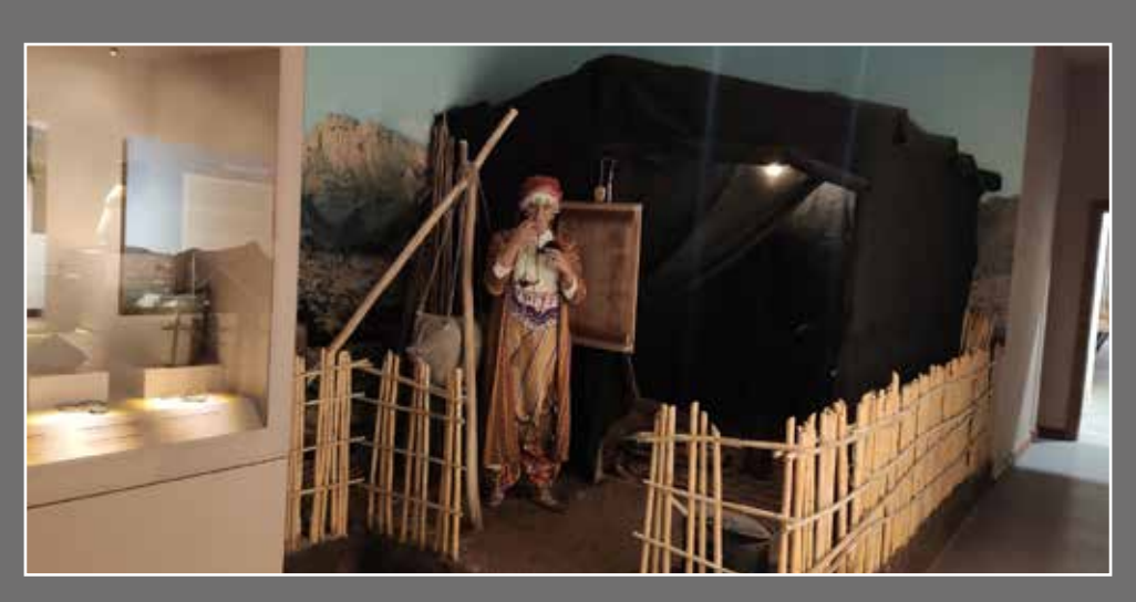
From the Prehistoric Period to the Hellenistic Period, from the Bronze House Animation Room to the Seven Sleepers Animation, from the Roman and Eastern Roman Mixed Hall to the Islamic Period Narration, from Tarsus Culinary Culture to Yoruk and Clothing Culture, there are sections and animations that reflect the periodical features, lives, history and cultures. We are waiting for our visitors on a cultural and historical journey that will take place by seeing, feeling and learning, supported by visual and auditory systems.