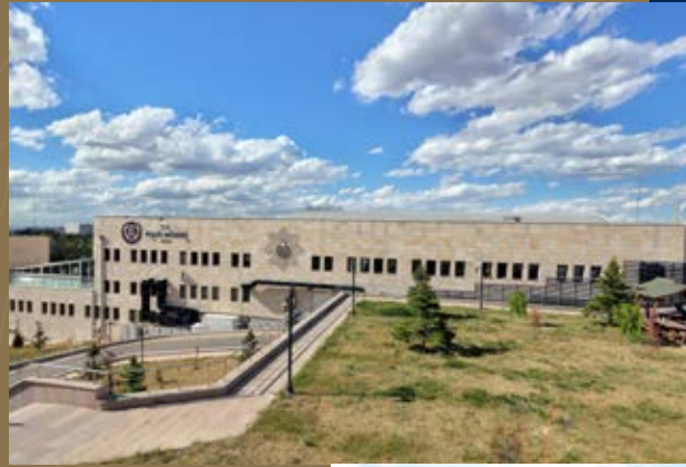
Outer View of the Museum

In Section F, Armored Police Vehicles are exhibited.