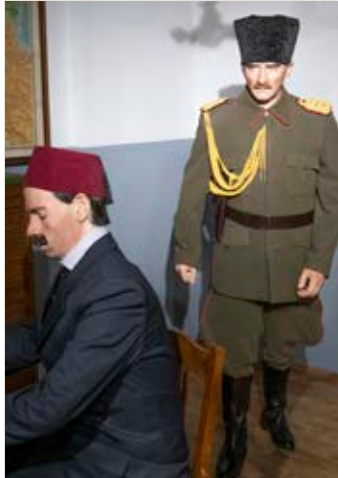
Mustafa Kemal Pasha's Animation, 1919

In the Police Museum, the stages of the Police Department, the methods followed by the police while maintaining public order, the events they encountered, and the tools and equipment they used are exhibited.