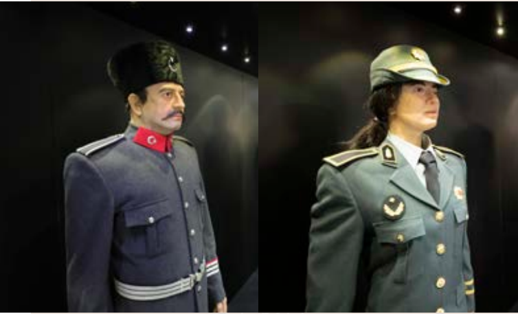
Historical Police Uniforms