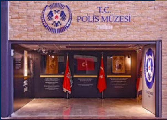
Entrance of Museum

The Turkish Police Force was established on 20 th March 1845 by Sultan Abdülmecit.