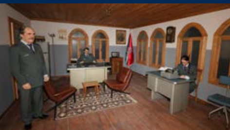
Animation of the Police Station, 1970

In the museum, the stages of the Police Department from the reign of Sultan Abdülmecid to the present, the methods followed by the police while maintaining public order, the events they encountered, and the tools and equipment they used are exhibited.