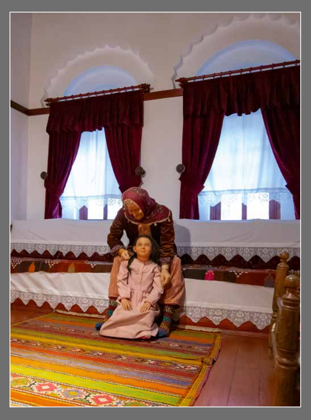
Handicrafts, fabric printing, clothing and accessories, kitchen tools and equipment, lighting, measuring instruments, firearms and cutting weapons and seals belonging to the Malatya region are exhibited.

Beşkonaklar, where a two-story mansion with a pinnacle (Cihannüma), a pavilion, and a balcony, and four mansions with similar architecture adjacent to it, which the leading families of Malatya reside and built by Hacı Sait Efendi (Turfanda) and his brothers 120 years ago, are among the original examples of the traditional civil architecture of Malatya. The mansions consist of two floors namely, the ground floor and the upper floor. Through the winged door, one enters the hall, which is called Hayat/taşlık, which is usually used in summer. The spaces on both sides of the hall are used as kitchen-fireplace, pantry and room, followed by the courtyard. There is a sofa in the middle and rooms around it in the upstairs