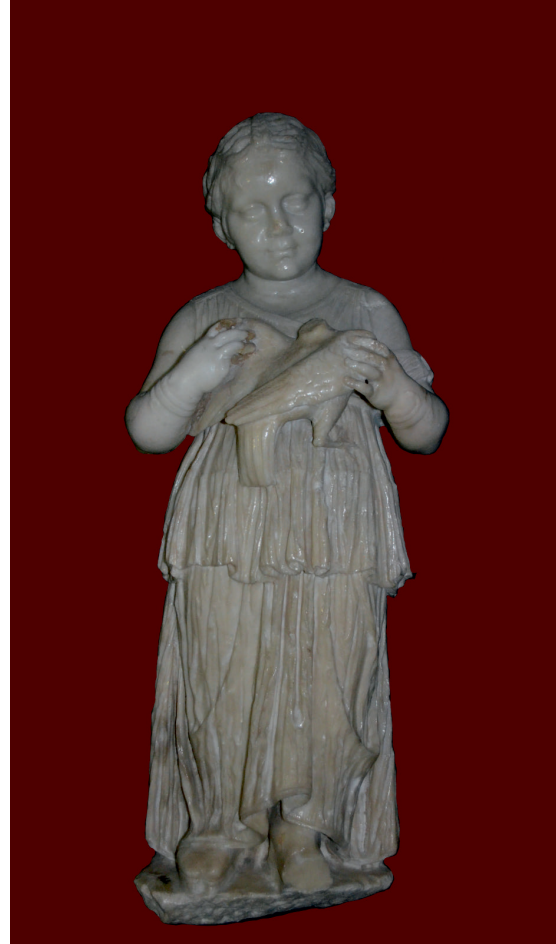
Statute of Standing Girl Holding Birds Roman Period

Ceramics take an important place among the artifacts exhibited in the Museum. The works belonging to the period between 3000 BC and Late Ottoman are on display in chronological order. Besides, it is possible to see unique pieces, such as Trilingual Inscription (Lycian, Greek, and Aramaic), Izraza Monument, and Bilingual Inscription (Carian, Greek) and works of the Lycian region, such as votive to God-Hero Kakasbos