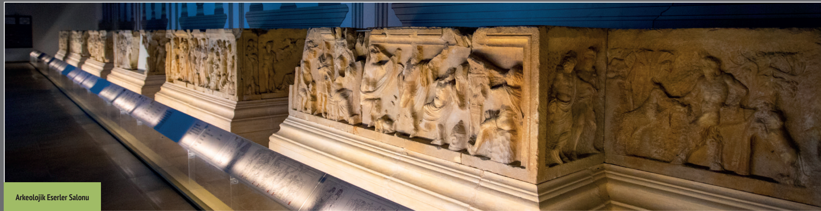
Arkeolojik Eserler Salonu

In the centre of the exhibition hall are displayed the four main panels of the Ancient City of Orthosia and the intermediate panels that allow the passage between them, as well as the mosaic of the borders that surround them. It has been visualised with an interactive work based on a battle scene on one of the panels of the floor mosaic of a 2nd century CE Roman villa. At the same time, sculptures, reliefs, relief stelae, altars, sarcophagi and ossuaries from different periods are on display in the stone artefacts hall, along with one of the highlights of the museum with his demonic smile, Pan, the protector of the shepherds and flocks.