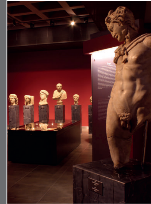
Mosaic and Stone Artefacts Hall

The coins of Lydian Period, Classical Period, Hellenistic Period, Roman Period, Byzantine Period, Seljuks and Ottoman Periods are exhibited in chronological order in the showcases of the coins section. Moreover, in addition to the city coins of the ancient cities which are in the jurisdiction of the museum, there are four different showcases in which the Kızıldereli Treasure is exhibited, which consists of silver coins of 29 emperors and 9 empresses from the years 40-270 CE and belongs to the rare collections. The minting animation in the visual area provides information about how the coins used to be minted.