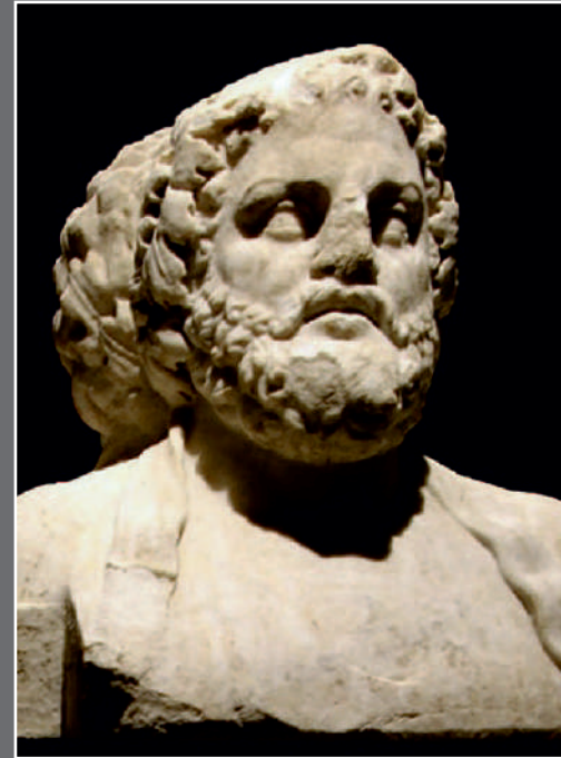
Tiberius Claudius Metrodoros Hermes and Honorific Inscription

Written on the tombstone by Seikilos of Tralleis, it is the oldest written poem in the world, nearly 2000 years old, which had been commissioned for him in his health, and later turned into a melody with a 6/8 note measurement. Seikilos' tomb stele is far from home today, waiting for the day it will return to the land it belongs to from the Copenhagen National Museum in Denmark.