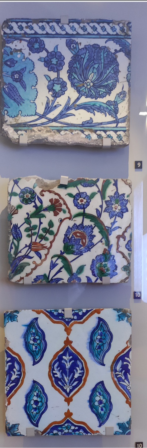
Social Life, Art and Trade Hall

In the Tile Hall section of the museum, the finest examples of tiles from architectural works are displayed alongside the Iznik tiles and pottery excavated during the Iznik Tile Kilns Excavation. There is also a section where the tile making and firing stages are animated.