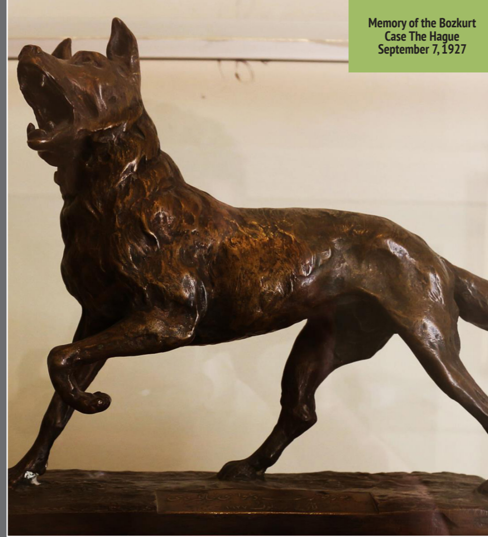
Memory of the Bozkurt Case The Hague September 7, 1927